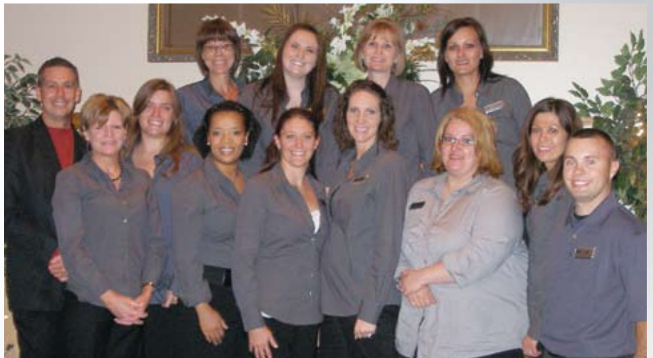
Your friendly team at Igel Orthodontics